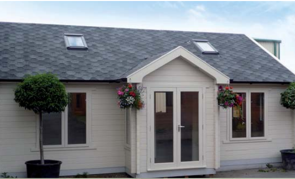
bespoke log cabin